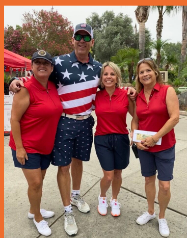
Hoop5 sponsored a hole at the AGC's 82nd Affiliate Day Golf Tournament!